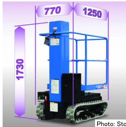
Photo: Stowed Position

The ULTRACOMPACT SIZE provides high maneuverability at the various job sites.