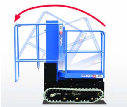
■ Tilt type platform