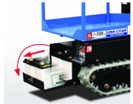
■ Drawer type battery box

Lower body is designed to provide high serviceability and allows full access to all internal components.