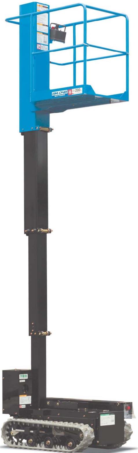
Photo: RM04B with standard color, Japanese specification