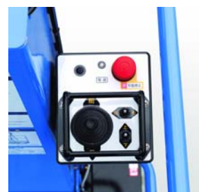
Photo: Upper control box

Proportional travelling and steering control system.